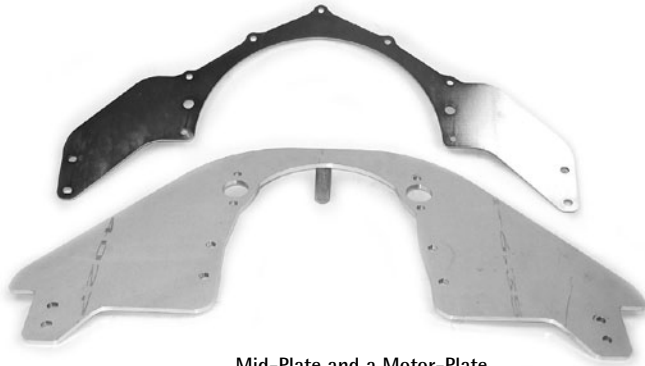
Mid-Plate and a Motor-Plate