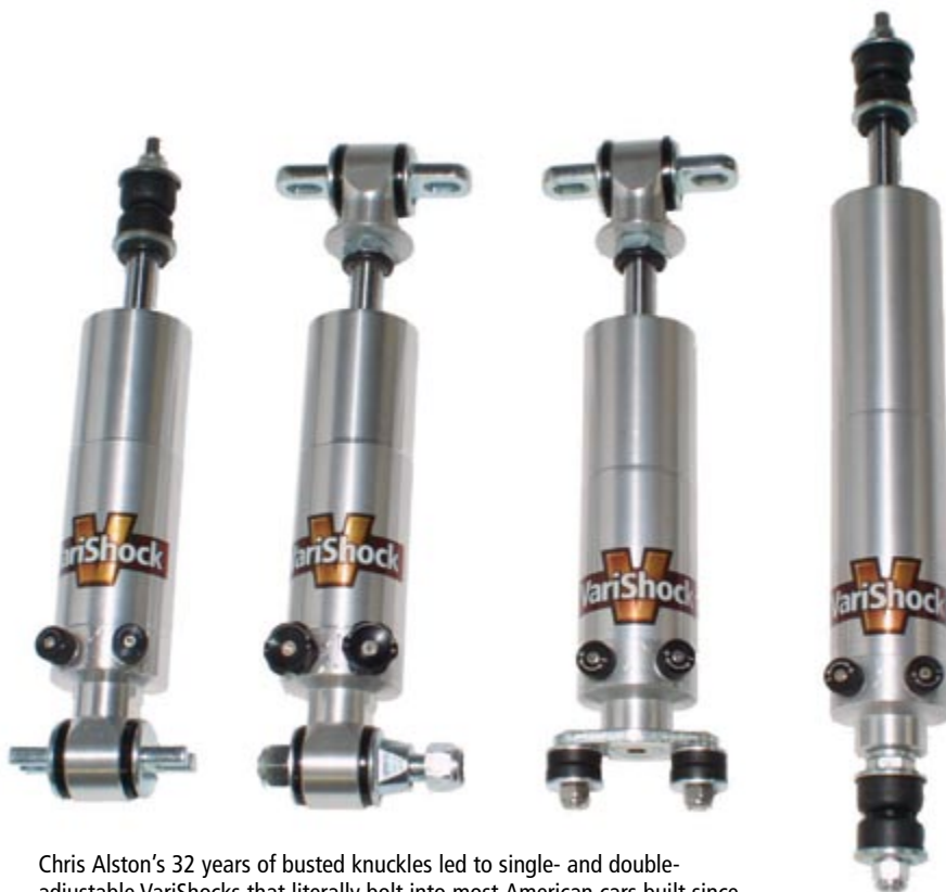
Chris Alston's 32 years of busted knuckles led to single- and double-adjustable VariShocks that literally bolt into most American cars built since the late Fifties, without interference. Twenty different types of top and bottom mounts duplicate OEM mounting styles, assuring easy installation.

Get an adjustable shock and tune it until it delivers the performance and/or ride quality that you want — then continue experimenting whenever track or road conditions change. If you want to take your street machine to the drag strip, you can make the front end fly up a little higher to transfer more weight and launch harder. If you want to autocross it, you can dial in the extra