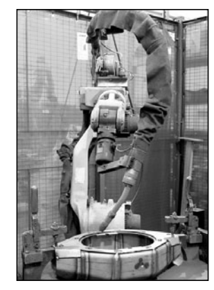
Robotic-spray arc welders consistently churn out error-free drag race products with strong and reliable welds.

building one of the most automated manufacturing facilities in the automotive aftermarket industry. In addition to a number of CNC saws, tubing benders. laser cutters. and press brakes, Chassisworks employs the services of multiple robotic-sprav arc welders. These marvels of manufacturing technology create perfect welds every time and significantly reduce the amount of manhours that factor into the cost of the final product.