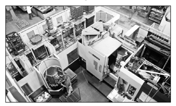
Chassisworks' manufacturing facility houses the latest in automated machining centers. This example features an automated two-tier fixture loading system and holds 160 different tools.

A variety of the latest high-speed CNC machines fill Chassisworks' machine shop. In the interest of efficiency, machines are continually upgraded with the newest advancements available to increase power, speed, capacity, and accuracy. Many of the production machines are equipped with automated feeders that enable the operator to bulk load the