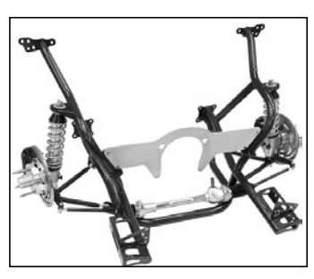
Chassisworks' 1962-67 Chevy II strut clip complete assembly lightly tips the scales at 124 pounds, including rack-andpinion, billet struts, and brakes.

In addition to bolt-on drag race products, Chris Alston's Chassisworks has built one of the largest product selections (more than 7,000 packaged goods), spanning multiple performance and enthusiast groups that includes race chassis and OEM platforms from drag racing, street performance, road racing, and sport trucks. For more information, log on to www.cachassisworks.com. ND