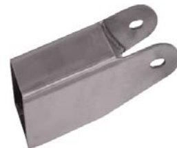
5322 & 5323 - Engine Mount Frame Adapter