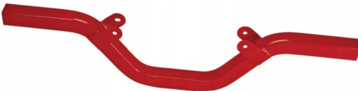
6060 - Billet-Mount Engine Crossmember

Custom-Fit Installations - The mount can be bolted to the engine block in either direction for greater flexibility in positioning the engine crossmember or frame adapters.