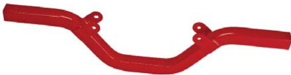
6060 - Billet-Mount Engine Crossmember

Installations - The mount can be bolted to a variety of frame adapter mounts offered by Chassisworks.