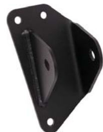
5914-XXX - OEM Frame Adapter