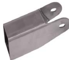
5322 & 5323 - Engine Mount Frame Adapter