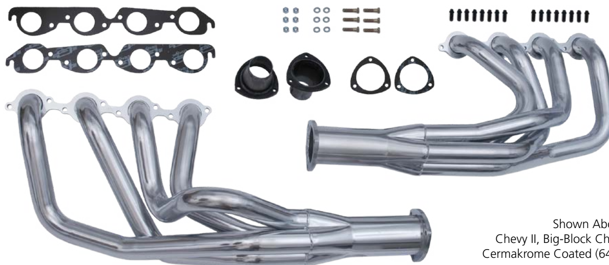
Shown Above: Chevy II, Big-Block Chevy, Cermakrome Coated (6451)