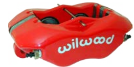
Available with red, black, or polished caliper, clear-anodized or polished hub, and uncoated or black E-coat finished rotor.