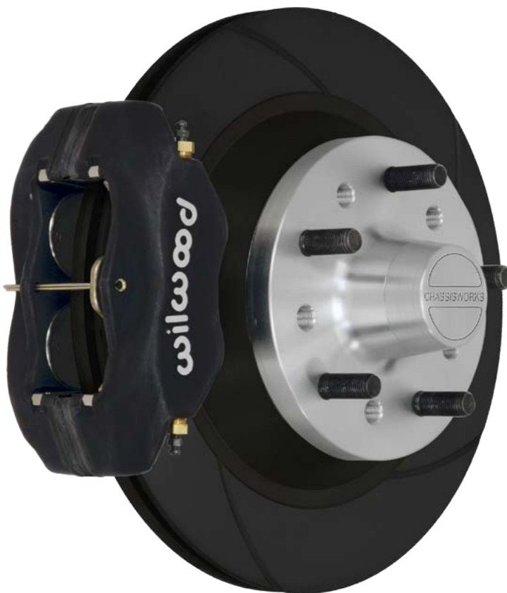
Standard Matte-Black- Anodized Caliper and Clear-Anodized Hub

All prices subject to change. Current pricing available at www.cachassisworks.com .