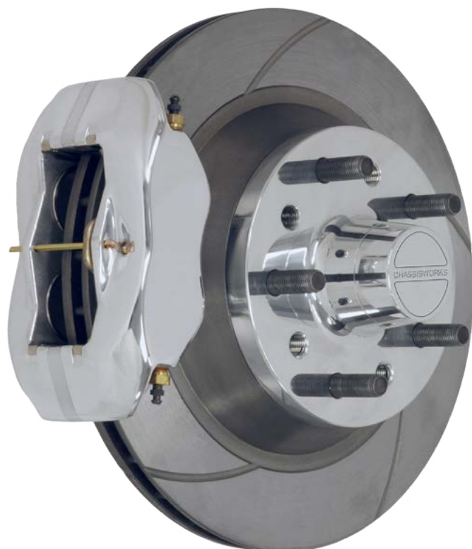
Optional Polished Caliper and Hub