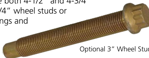
Optional 3" Wheel Stud

Billet aluminum hubs reduce unnecessary weight and allow components to be easily replaced if damaged or worn. Hubs are silver-anodized machine-finished with matching screw-on, O-ringed cap to prevent oxidation and resist scratching. Assemblies include both 4-1/2" and 4-3/4" five-lug bolt patterns with 1/2 x 2-1/4" wheel studs or optional 1/2 x 3" studs. Wheel bearings and seals also included.