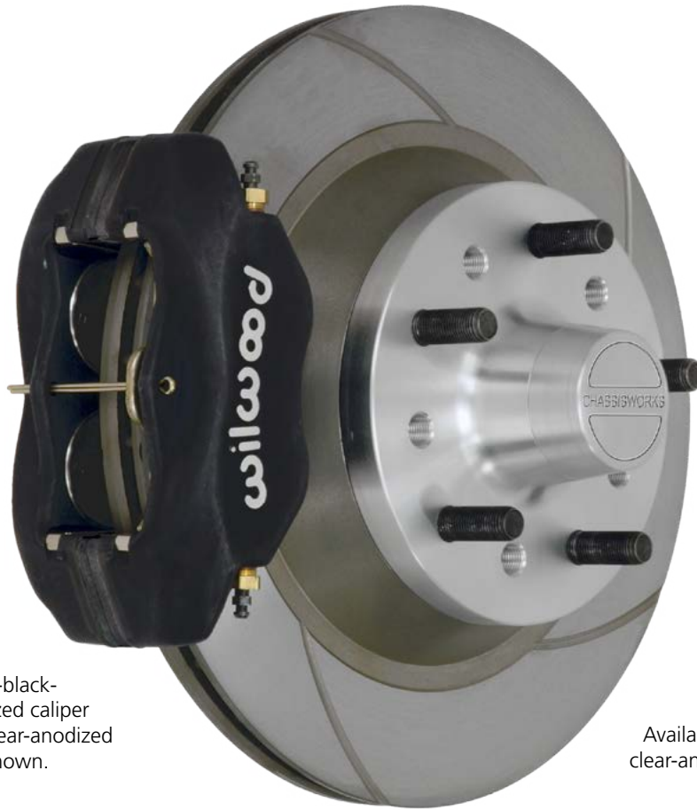
Matte-black-anodized caliper and clear-anodized hub shown.