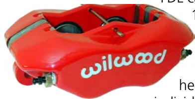
Optional red caliper

FDL calipers use one-piece, 1.75"-diameter, stainless-steel